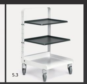
5.1 mobile unit (W38 H85 D43cm) for electrical appliances with 3 shelves 5.2 mobile unit (W45 H85 D49cm) for electrical appliances with 3 shelves5.3 Friday trolley for handling electrical appliances, bagged sterile instruments, infected material, sharps and a waste separator